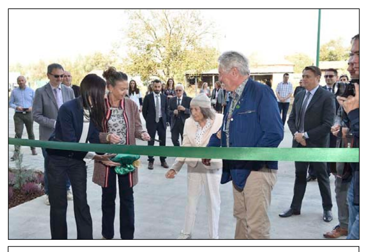
Ribbon cutting ceremony.

2018 has been especially successful for our plant. Along with the growing sales the company finalized its expansion and entered numerous new projects. We became a partner in the €1.95 million European BIOCOMPACK project supported by the Interreg CENTRAL EUROPE. We also launched Europe's first collection and recycling initiative for used films and plastic bags. Both projects are aimed to decrease plastic waste in Europe, one of the world biggest growing problems. We can proudly say that EcoCortec<sup>®</sup> is becoming one of the most productive plants in the industry in Europe. Our team is especially proud to be spreading environmentally safe corrosion protection technologies in Croatia and abroad.